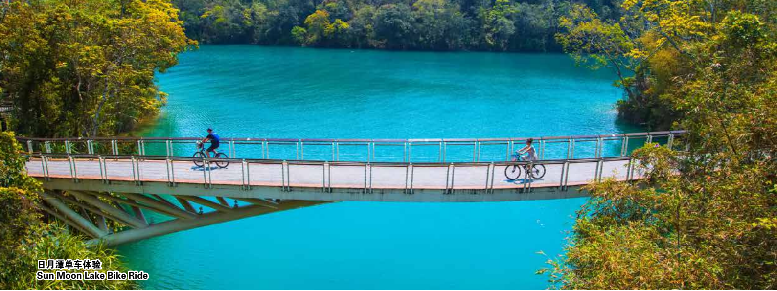
日月潭单车体验 Sun Moon Lake Bike Ride