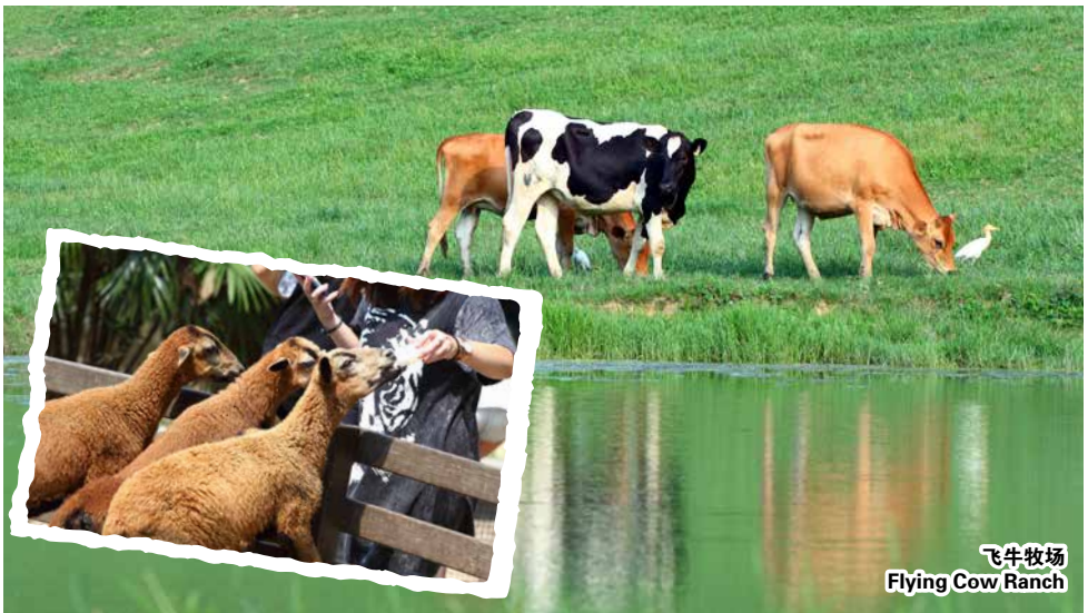
飞牛牧场 Flying Cow Ranch

送往机场，返回温暖的家。 ✂️ 早餐：酒店或早餐盒 ※ 行程可能会以最终确定的航班而前后调动。